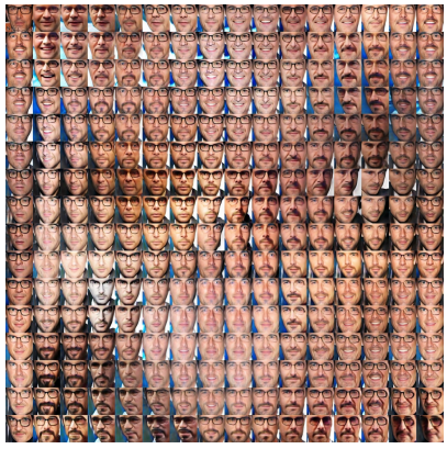
Fig. 2. An Interpolated spherical subspace[43] of the GAN generation space on Omniglot and VGG-Face respectively. The only real image (x_i^c) in each figure is the one in the top-left corner, the rest are generated to augment that example using a DAGAN.